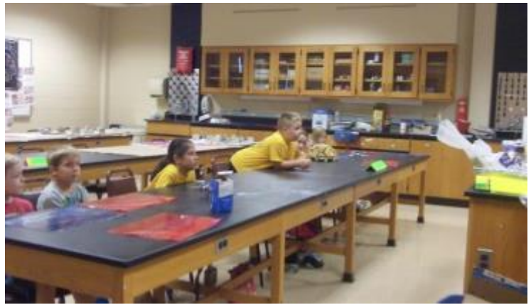
Students actively engaged in learning!