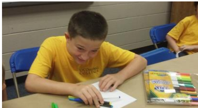
A student making a “Thank You” card for the guest speakers in Detective Academy