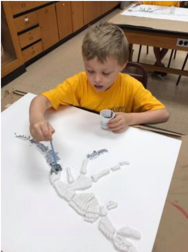
Super Science Dinosaur Fossils