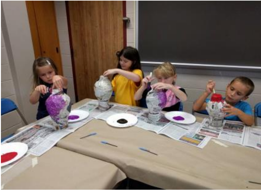
Young Artists working on their vases