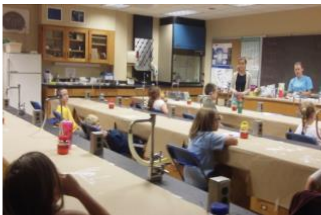
Grossology students in action!

Ewwww! In Grossology, everything is gross, from dissecting owl pellets to making poop. They use everyday grocery items and make it disgusting. The idea behind the class is the art science and exploration.