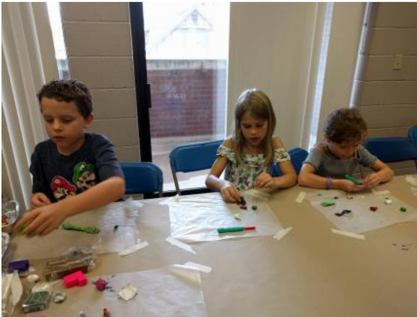
A real "hands on" approach to learning!