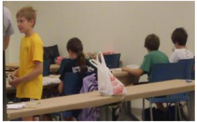
Students working on their toothpick bridges

I asked all of them if they would recommend this class to future students and they all said yes! As you can see, this class provides fun and opportunities!