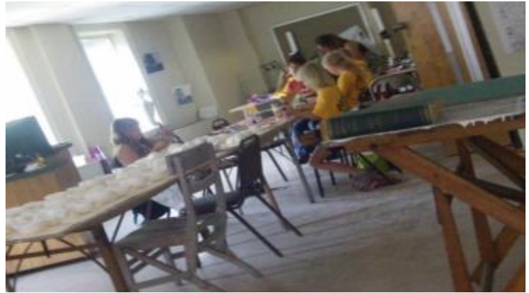
Students in Global Arts designing their masks

When I asked one of the students what she liked about College for Kids, she said she liked that the kids had the freedom to pick what they wanted to do. So far they have been working on sugar skulls, masks and ofrendas. Finishing the interview, she said she would definitely do the class again. If the activities changed year after year, she'd be back because she loved the class so much!