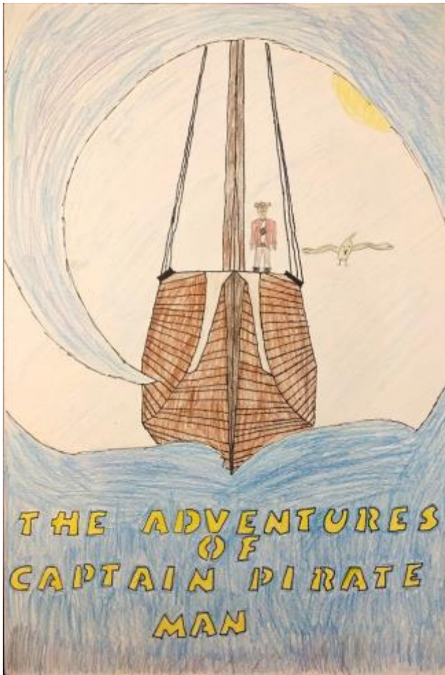
Student Art work

I started the interview off by asking her a few simple questions. "What class is this? Do you enjoy it?"