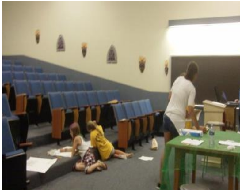
Students lost in their own worlds!

In fantasy story telling you write your own story but not only that, you draw pictures and maps of your fantasy world. While in there. I saw the students drawing/ sketching their maps. Also, while in there I interviewed a student and teacher; here's what they had to say.