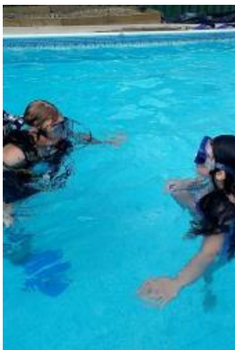
Learning the ropes

Even if scuba isn't your thing, believe me, everyone can find a class here at Lycoming College for Kids.